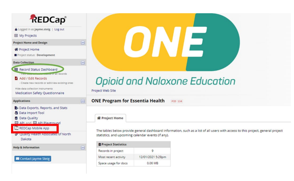
Figure 1 – REDCap Project Home

Please contact jayme.steig@ndsu.edu with any questions.